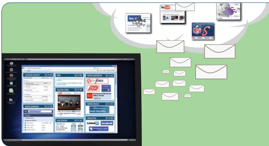
The use of the Web in spam attacks continues to grow.

Although they are now commonly used, these engineered attacks are very targeted and difficult to detect by traditional techniques. Cybercriminals often send very small messages with links to seemingly legitimate websites that slip by most spam and malware defences. Reactive, signature-based approaches and reliance on URL reputation are not enough to protect end-users from these malicious attacks.